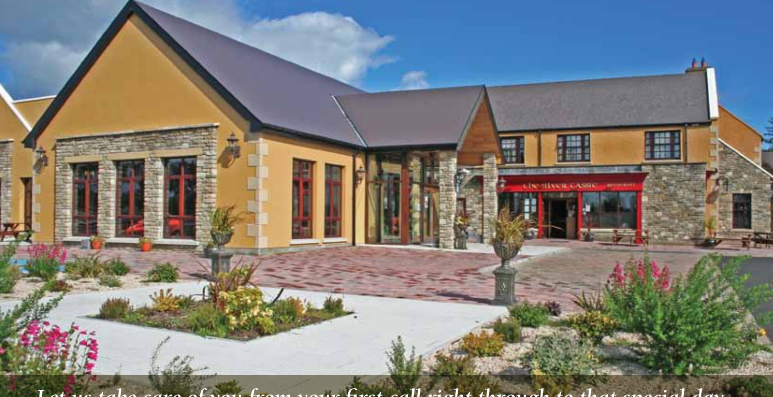
Let us take care of you from your first call right through to that special day

Thank you for considering the Silver Tassie Hotel for your forthcoming marriage. May we take this opportunity to congratulate you on your engagement and extend our best wishes for your future together.